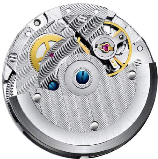
Original automatic rotor

The production department carefully selects heavy metals with thick edges, so most of the mass is on the edge of the rotor, using the gravity of the earth and the swing of the human arm to rotate, and drive a set of gears to wind up. The clockwork comes to wind. Prevent rust and increase aesthetics. The escape wheel, pallet fork and balance wheel are the key parts in the watch. The quality of the automatic hammer has a great influence on the watch, so strict processing must be carried out in the processing. All parts in the watch must be inspected or sampled, and then the watch will be assembled in a clean workshop. Assembled watches must be inspected in accordance with the standards issued by the ministry, and the quality is required to be all qualified before they can leave the factory.