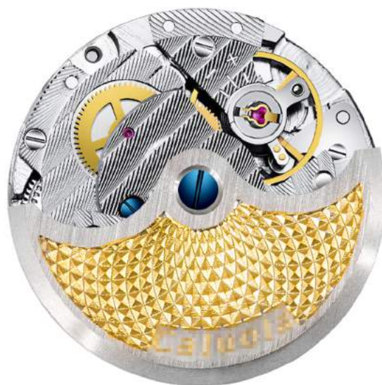
Personalized automatic rotor